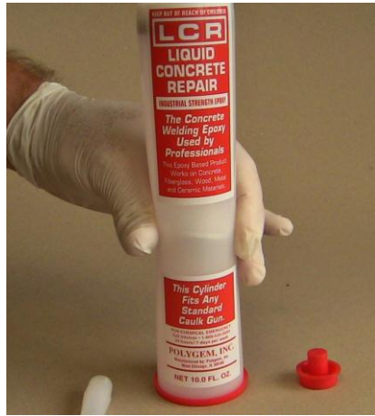
5. Gently squeeze the cartridge to deform the tin-foil barrier.