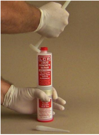
1. Pry off top Red Cap