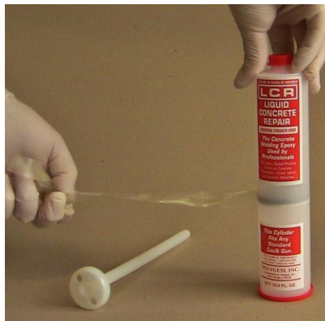
2. Remove tape band from middle of Cartridge