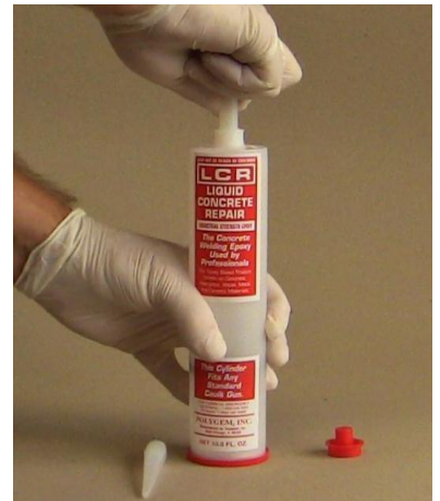
6. Firmly hold the Cartridge on a hard surface and pump the mixing handle up and down with full strokes 15-20 times.