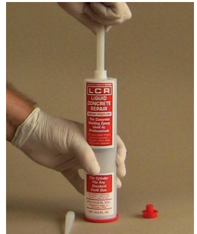
3. Insert long mixing rod into the top of the cartridge until it seats into the mixing wheel inside the Cartridge and turn clockwise until the wheel turns.