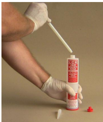
7. Unscrew the mixing rod and remove and discard.