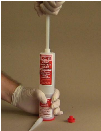
4. Firmly hold the Cartridge on a hard surface and pull up sharply to disengage the wheel from the tin-foil barrier.