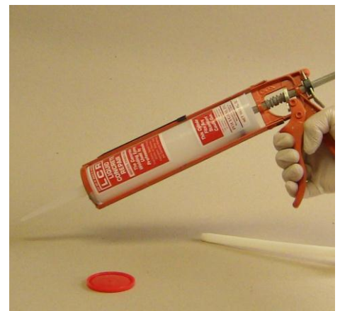
9. Remove red cap from bottom of cartridge and place into a standard caulking gun.